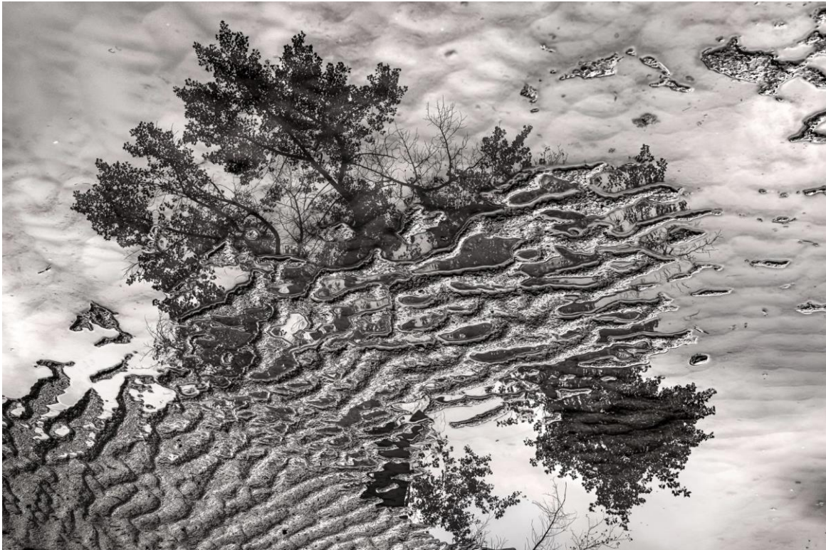
Canyon Pond – Chuck Kimmerle

think of as the 'in between.' I am most comfortable, and at my most creative, in areas which are reticent, quiet, and open. The areas in between."